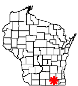
Project Location in Wisconsin

Sources Basemap: ESRI AGOL Bathymetry and Hydro: Tigris 2022 (Onterra Modified) Lake Outline: Onterra 2025 utilizing NAIPs 2022 Aquatic Plants: Onterra, 2026 Map Date: 6-4-2026 TWH